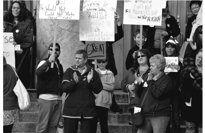
Rep. Chris Tuck joined parents and kids at a recent rally for education on the Capitol steps.

1. The new law makes the use and possession of one ounce or less of marijuana legal, and directs the state to tax and regulate the production, sale, and use of marijuana in Alaska. Which statement best reflects your opinion?