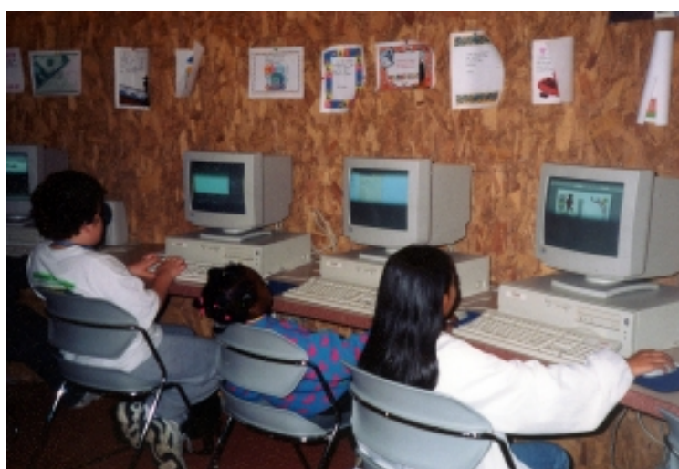
NEW MEMBERS USING THE NEW COMPUTER

The Mountainview Community Center has a full size gymnasium, teen center, game room, computer room with internet access, room for arts/crafts, industrial size kitchen with a connecting multi-purpose room, storage rooms, meeting rooms downstairs and opening in January, a One-Stop Job Center.